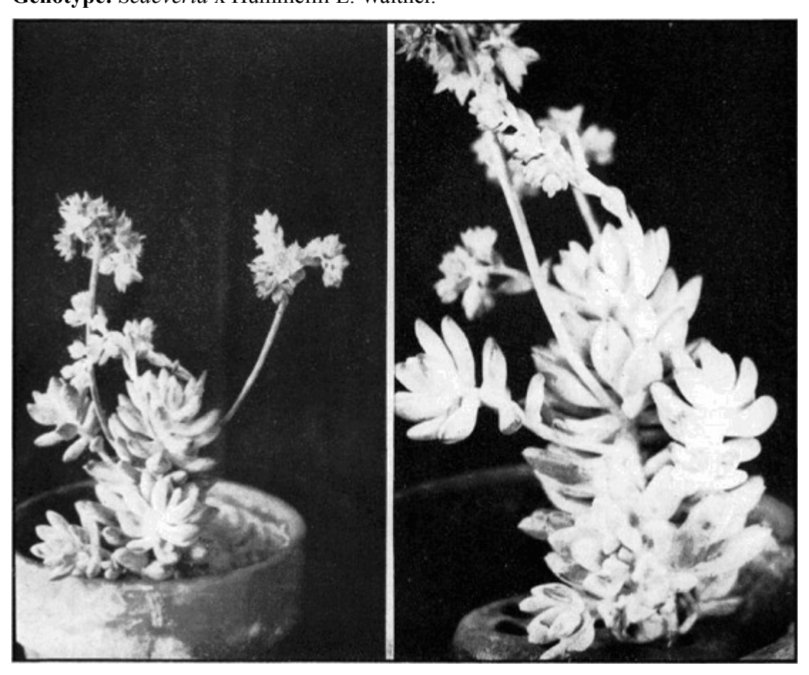
FIG. 13 : LEFT: 21a. Sedeveria x Hummellii, flowering plant, app. x 025; RIGHT: 21b. Sedeveria x Hummellii, foliage, app. x 0.35

"SEDEVERIA: hybridae inter Echeveriam et Sedum, characteribus intermediis sunt." Genotype: Sedeveria x Hummellii E. Walther.